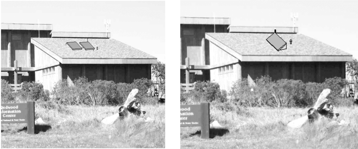
Figure 2. Renderings of two collector configurations, pictured on the roof of a section of the RIC.

The equation for determining collector area is